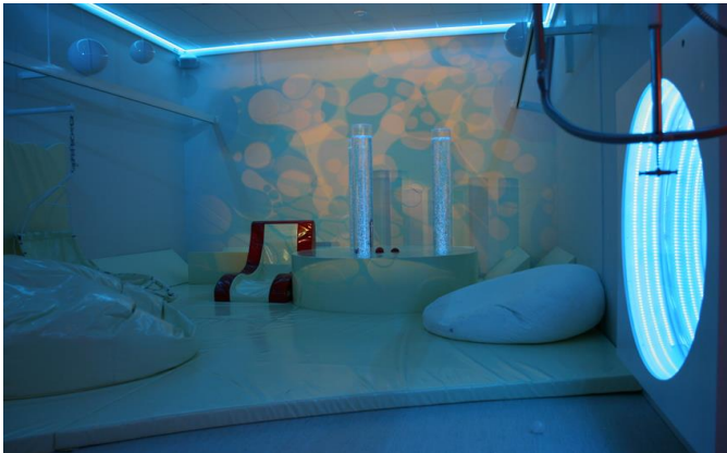
The new Snoezelen room ( 2017)

The practice time during the special program take place in the 400 m 2 Snoezelen Complex of the Centre De Hartenberg.