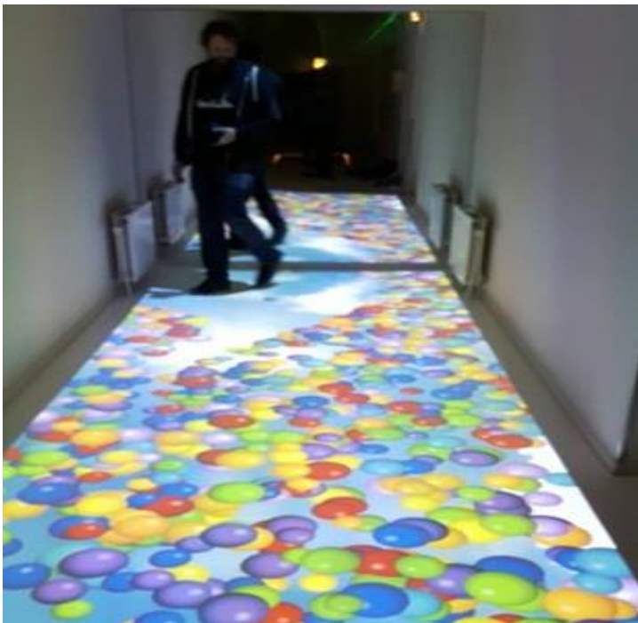
Living surface, an interactive floor

-“As normal as possible, specific only if needed”-