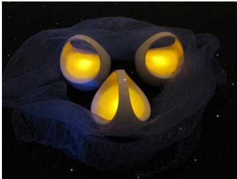
Battery operated candles by Philips – used in Korea either to transition people from one area of the Snoezelen environment to another, or to attract people to a particular area/focus