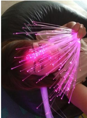
Exploring fibre optics, Bilbao

Throughout this experience I documented my observations, conversations, thoughts, and discoveries about strategies that were used by Snoezelen teachers and facilitators to support different transitions that participants faced. Strategies were similar in many places, with some variation due to the training and philosophical beliefs of those providing the sessions. In general, these strategies included: