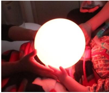
Sensory session in hospital, Japan

In Germany I visited a hospital where Snoezelen sessions were incorporated as an important part of patient care. Facilitators of these sessions undertook Snoezelen training, and provided sessions to settle and relax patients before and after transitions, as well as to encourage communication, and to develop self-esteem and trust. As with many Snoezelen programmes I observed, sessions focussed on the provision of pleasurable relaxing experiences – the activities offered during sessions tended to be familiar and therefore comforting to participants.