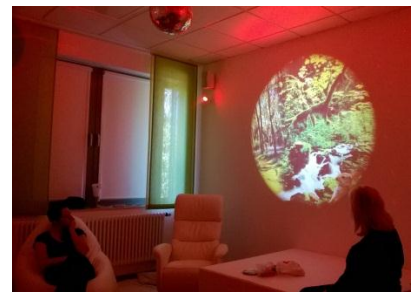
Changing moods in a hospital Snoezelen room, Germany

In Germany, Snoezelen rooms in special needs schools were very popular with both teachers and students. One school I visited used their sensory room frequently throughout the day with groups of 2-15 children. Teachers reported that due to the ability to control the sensory environment, children were less distracted and more focussed during Snoezelen sessions than they were in the classroom. The sessions were utilised to reinforce learning in a practical way, as well as to settle and relax children at the beginning at end of the school day in order to ease transitions between school and home.