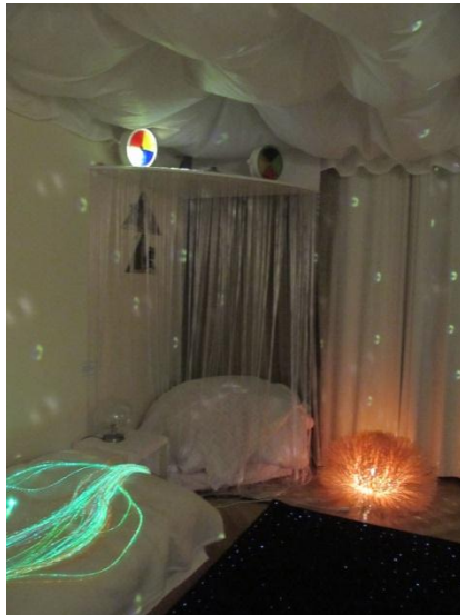
White room in Germany

The Snoezelen environments I visited in Switzerland were similar to those I had seen in Korea, Japan and Germany – carefully designed ‘white’ rooms which allowed for creative environmental change. In contrast to this were the brightly coloured Snoezelen environments I observed in special schools and an orphanage in Ostrava and Brno, Czech Republic. These facilities had a much higher level of visual stimulation to arouse interest, with a variety of colourful furniture and equipment displayed in the rooms.