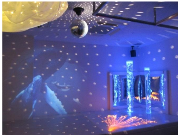
Snoezelen environments, Japan

A number of the Snoezelen facilities I visited in Japan were accommodated in institutions for people with profound cognitive and physical disabilities. These sessions were more often based on the philosophy of free Snoezelen (where people are encouraged to explore the environment at their own pace and in their own way), rather than guided Snoezelen (where sessions are more structured and generally include initial exploration of the environment followed by a planned activity and a period of relaxation such as guided imagery or massage). As with all countries I visited, Snoezelen sessions were largely influenced by the training and philosophy of companions, teachers and session facilitators. For example, some provided sessions that were focussed primarily on relaxation and wellbeing, while others incorporated therapy or educational goals in their sessions.