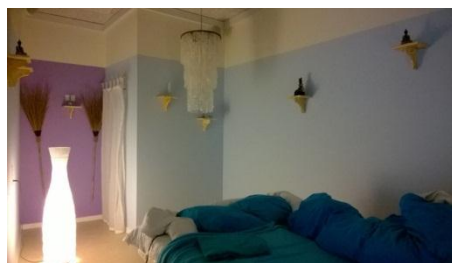
Golden Horn, Solund, Denmark

Links with home were recognised as important for supporting people's positive experiences – thus individual preferences within each sensory room were recorded on a computerised card and stored for future visits. This facility, like others I visited in Denmark, supported transitions in a number of ways, for example, by encouraging family participation, by timing sessions immediately before stressful events so