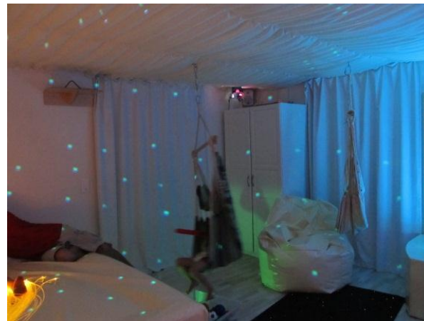
White room in Switzerland