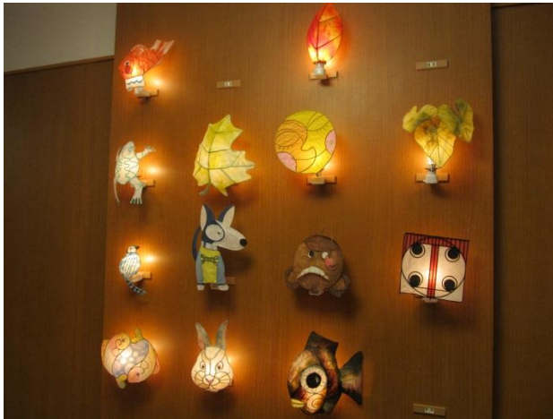
Transitional resources used in a hospice in Japan - handmade paper light covers that children can choose for their rooms and take home