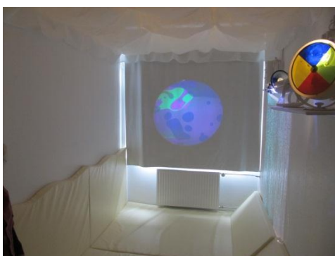
Snoezelen room in special school, Germany

In Germany, Snoezelen rooms in special needs schools were very popular with both teachers and students. One school I visited used their sensory room frequently throughout the day with groups of 2-15 children. Teachers reported that due to the ability to control the sensory environment, children were less distracted and more focussed during Snoezelen sessions than they were in the classroom. The sessions were utilised to reinforce learning in a practical way, as well as to settle and relax children at the beginning at end of the school day in order to ease transitions between school and home.