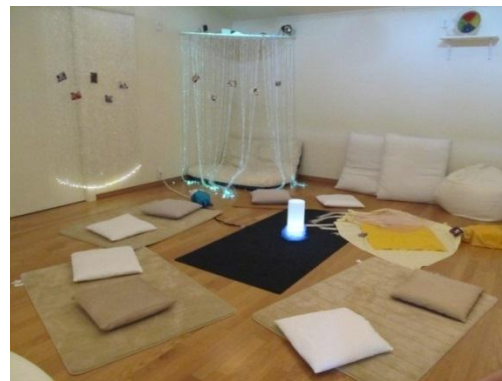
Individual session for participant on waterbed Preparing the environment for a group session

One of my highlights at the centre was observing a Snoezelen session provided for two young siblings. The use of the children's favourite story (The Rainbow fish) was incorporated into the session to provide a sense of familiarity and comfort, thus supporting the children's transition from home to the centre. An underwater atmosphere was created for this session, with the focus on motivating the children to actively explore the Snoezelen environment. Soft blue and green lighting was provided to represent the sea, a fibre optic curtain was used to create an underwater cave, and a multi-coloured rainbow fish constructed from balloons, scarves, and fibre optics featured in the room along with strategically placed shiny coloured 'fish scales'.